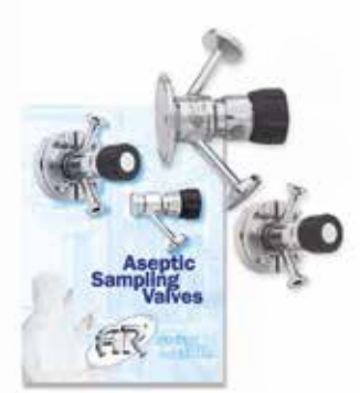
ASEPTIC SAMPLING VALVES