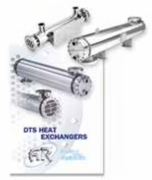
DTS HEAT EXCHANGERS