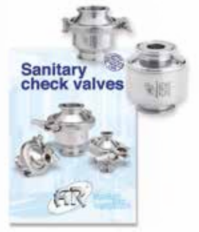
SPRING CHECK VALVES