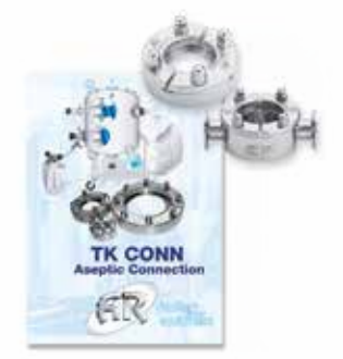
TANK AND IN-LINE CONNECTIONS