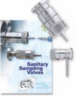
SANITARY SAMPLING VALVES