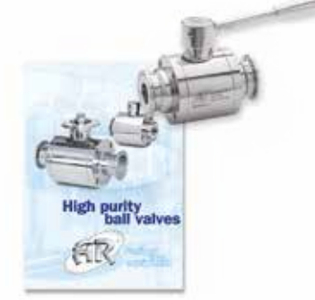
HIGH PURITY BALL VALVES