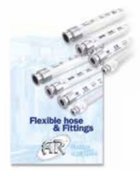
FLEXIBLE HOSES & FITTINGS