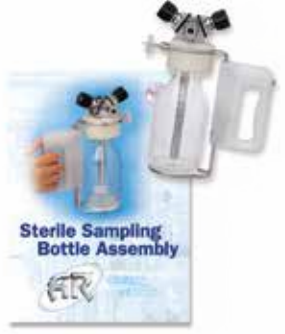
ASEPTIC SAMPLING BOTTLE