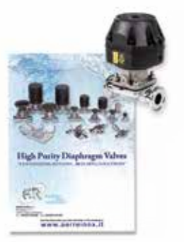
HIGH PURITY DIAPHRAGM VALVES