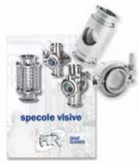
SIGHT GLASS-FLOW INDICATOR